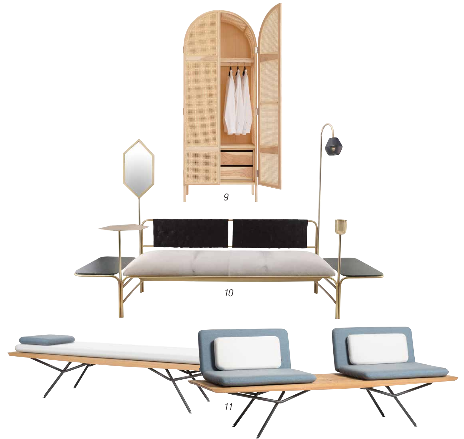
7 Tie bench | Deesawat Thailand Founded in 1972, Deesawat is one of the leaders of a thriving wood industry in Thailand, with furniture that brings strong esthetic as well as narrative qualities. For example the Tie bench, with Braille message in relief on the back promoting blind people to stay with others and share their experiences. It says "If you sit alone, try to move to the side, and leave some space for the people to share with you." www.deesawat.com